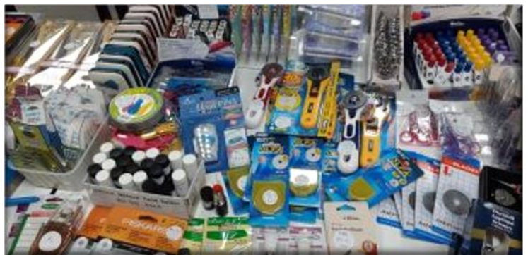
Just some of the quilting goods on offer