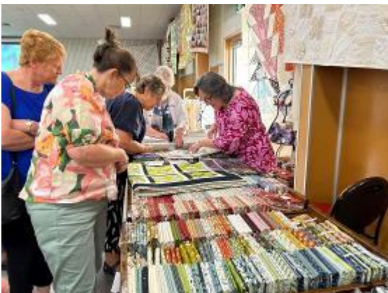
Rural Roundup Shoppers

We thank all our guests for making it a great day of socialising and fellowship.