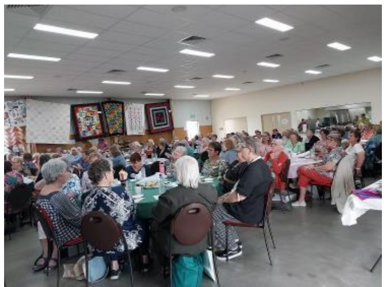
Rural Roundup attendees