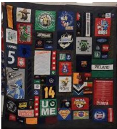
Elaine's T-shirt quilt