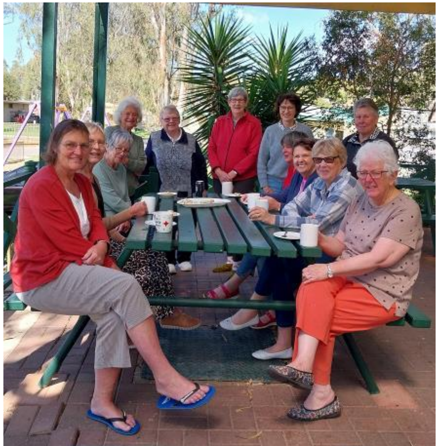
A photo of the Masonic Quilters and Craft Group who are located at Tailem Bend