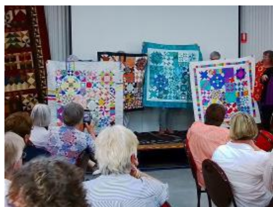
Show and Tell SA Quilters 40th Birthday Sew Along