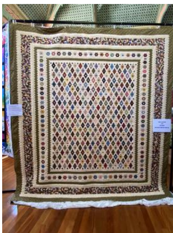
To Insanity and Beyond - Viewers Choice Winner