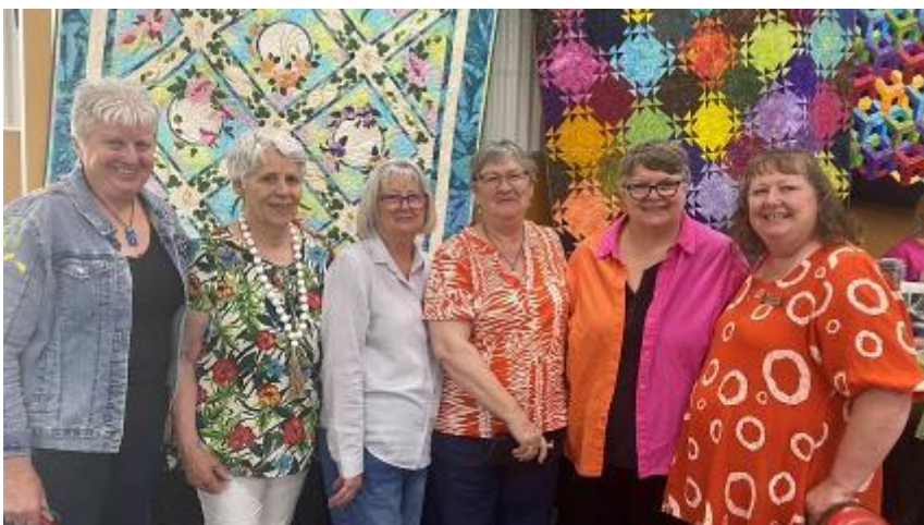
Photo of Renmark Evening Star Quilters meeting with their sister group