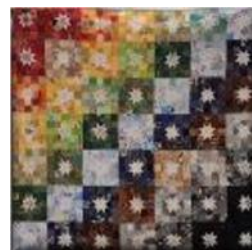
Claire had six quilts