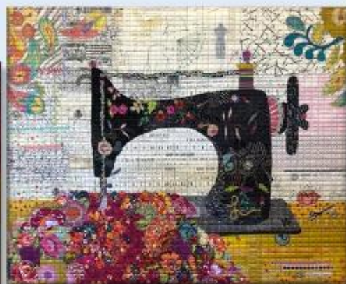
Illustrations: Laura Heine patterns

Go to the Workshops page on the SA Quilters web site For details on how to register including application form. Click on Workshops .