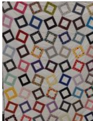
Wendy - Lots of Spots